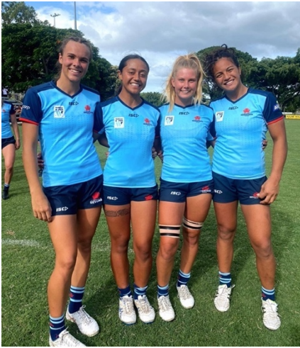
NSW Women's Waratahs

The Division 2 team finished 3 rd in their division which had 14 teams broken into pools of 4 teams.